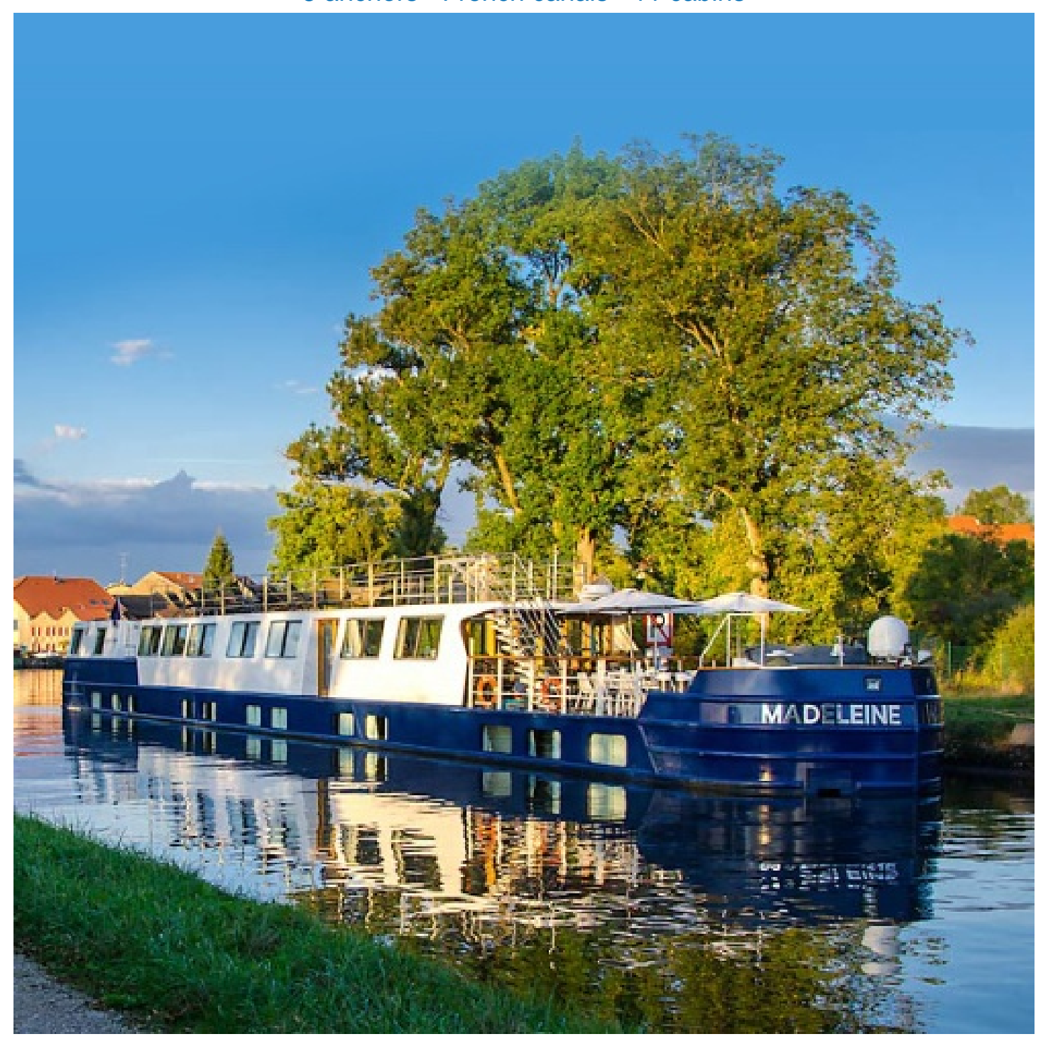
5 anchors - French canals - 11 cabins